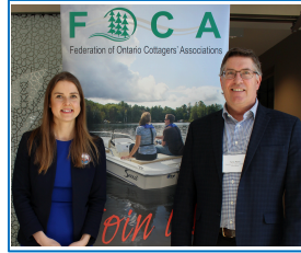
Effective Government Relations