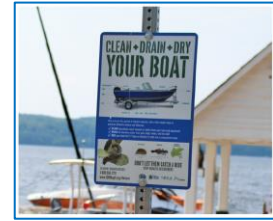
Advancing Science into Action!