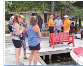
Bridging Gaps in Rural Communities