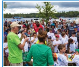
Supporting Volunteer Lake Associations